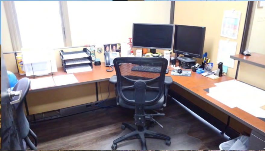
Plant Dispatcher's Office